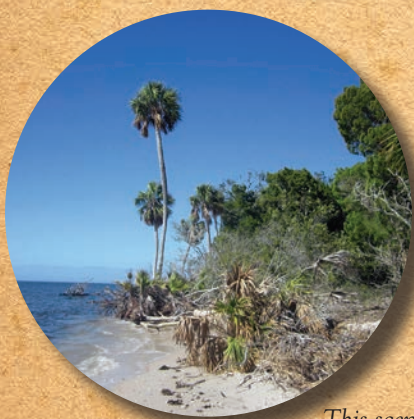
This scene along the beach looks toward the west. The abrupt edge of the upland consists of a layer of tightly packed shells overlain by a thin band of soil. No more than a few meters wide, this band of upland supports a variety of terrestrial plant species. Ongoing erosion is evident. The prostrate palm tree near the center of the image still has green fronds, and clearly was recently uprooted.

The crescent-shaped ridge of high ground that partially encloses Cat Island follows a pattern recently discovered by University of Florida archaeologists. Some accumulations of shells left by Paleoindians are obviously middens—piles of discarded waste that remain from harvests of shellfish. Others, like this shell-based construction were clearly planned and had some purpose. Their true purpose, however, remains unclear. One unknown is the effect of sea level rise over recent millennia. Available data indicate relatively little change in sea level over the past 4,000 years. Between 3,000 and 4,000 years ago sea level averaged about one meter below its current level. More recently it has remained at, or been as much as one meter above current sea level. So for part of its history, Cat Island might have been closer to the mainland than it is now, and the present marsh could have been habitable land. At other times the island might have been partially submerged and more subject to erosion. When sea level was lower the purpose of the wall of shells might have been to protect the central part of the island from storm surges. Perhaps progress in dating the remains will help to shed some light on this hypothesis. Whatever has happened over the past 4,000 years, it is clear that recent rises in sea level are causing extensive erosion. The archaeologists are keenly aware that they must work diligently before it's too late for this and similar sites give up their secrets.