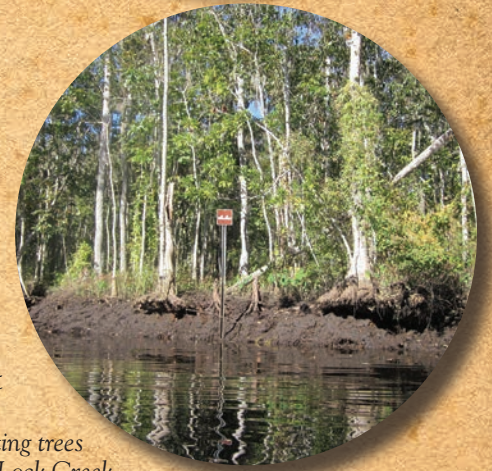
Bank erosion undercutting trees along Lock Creek

Possibly the best known of Suwannee paddling trails, this takes one through small creeks that wend through swamps and marshes. Light filtered through the leaves of tupelos, ashes, and swamp bay, and reflected off still waters casts an enchanted glow on a surprising variety of wildflowers. Fishes and alligators are abundant here, but this is the true haunt of wood ducks, river otters and turtles. Paddlers encounter much evidence of the effects of twice-daily tides. Erosion of soil from the banks undercuts large trees, and areas of mud are deposited elsewhere, depending on currents and eddies. The creek and the land are thus in the constant process of formation and reformation. Unfortunately, erosion of the banks makes for frequent treefalls that may block channels and impede the progress of paddlers.