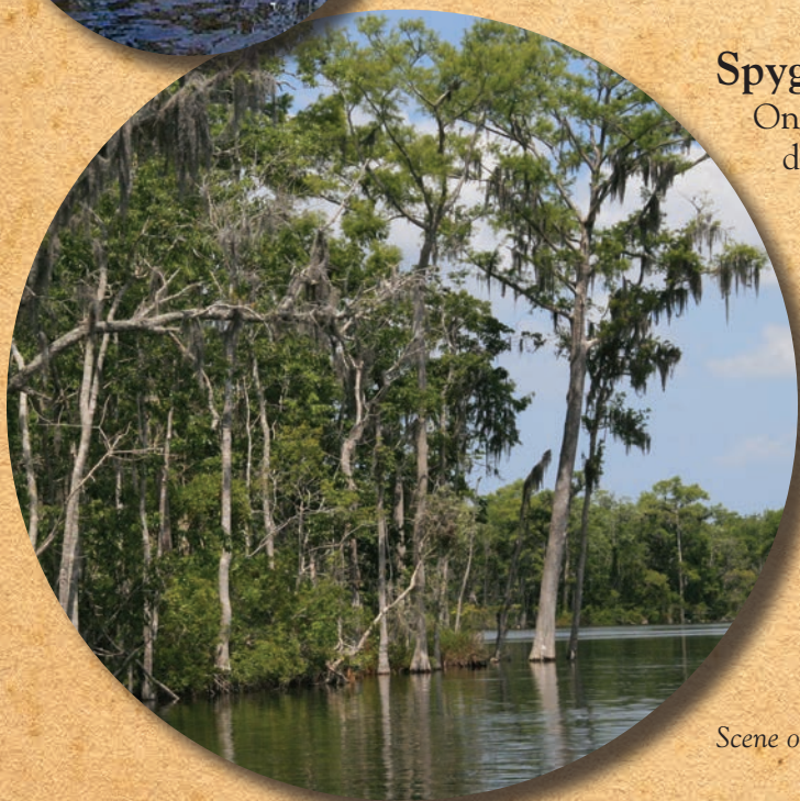
Scene on the banks of the lower Suwannee River.

One of the great rivers of the southeast, and unique among them in being neither dammed nor channelized, the Suwannee provides habitats for a great variety of plants and animals. The reach of the lower Suwannee passing through the refuge is affected by twice-daily tidal fluctuations. Its water is generally dark colored, but lighter than the tea-colored water of the upper Suwannee because it has mixed with the clear waters contributed by springs as it traveled southward. Magnificent as it seems, it is not a virgin forest that lines the shore. In fact it is relatively young. Extensively logged, first for cypress and then for hardwoods, these lands were changed not only by the removal of trees, but also by the building of roads, ditches, and rail lines needed to get to the logs and to get them out. That regeneration of the forest has come this far is a testimony to its resilience.