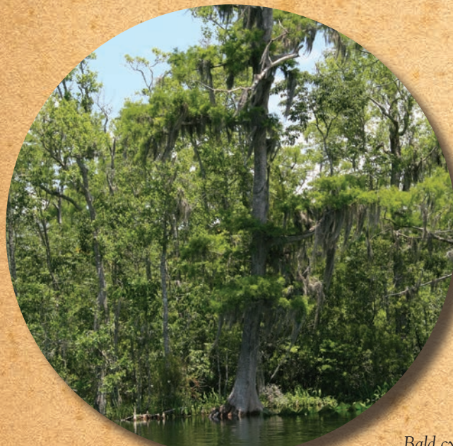
Bald cypress on the Suwannee riverbank.

The parts of the lower Suwannee coursing through the refuge are mostly freshwater, but tidally influenced. The regularity and degree of the twice-daily flooding greatly affect the vegetation; bald cypress, tupelo, and pumpkin ash dominate areas regularly flooded areas of swamp. Away from the river they are joined by other swamp dwelling trees, and in further inland bottomland hardwood forests take over. Large animals that may be seen in the Suwannee and in few other rivers include Gulf sturgeon, an ancient fish that may reach eight feet in length and weigh 200 pounds. They are found in the Suwannee in spring and summer, and may be seen making spectacular jumps out of the water. Many species of fishes and turtles inhabit the river. Another large animal seen less frequently is the West Indian manatee. Manatees are in the river during the warmer months and migrate into warmer spring runs in the winter.