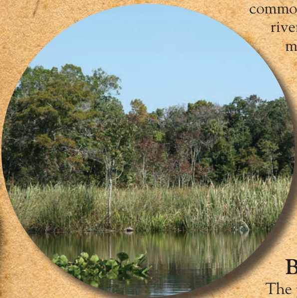
Spatterdock (left foreground) and sawgrass (mid right) in a quiet area off the Suwannee.

Shallows in backwaters of the Suwannee are often covered by vegetation characteristic of ponds or marshes. Spatterdock is a normally pond-dwelling plant that is very common in the backwaters and in shallows in the main stem of the river. It adds to habitat diversity, providing shade and cover to many invertebrates and fishes, and food to some of them. Small animals provide food for larger predators like basses, aningas, otters, and alligators, all of them most at home in fresh water environments. Sawgrass and wild rice occupy patches in still shallower areas and, like spatterdock, add to habitat diversity. More importantly, the leaves and seeds of these these plants provide food for ducks and other wildlife.