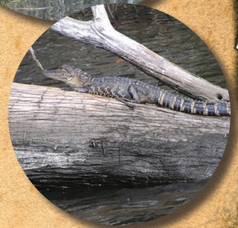
Basking alligator.