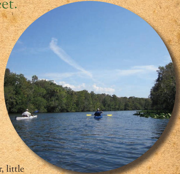
The Gopher River near its confluence with the Suwannee.

Crossing the main stem of the Suwannee and entering the mouth of the Gopher River, little change is noted at first. The Gopher River looks like a slightly smaller version of the Suwannee. Its widely separated riverbanks are populated by bald cypress, mixed hardwoods, and occasional tall cabbage palms. A major change is experienced when one reaches the large meander, about \frac{3}{4} mile from the river mouth. See Spyglass below.