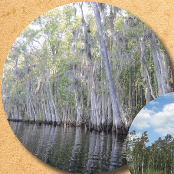
The upper image shows the south (outer) bank at the meander, and the lower shows the inner, or shorter bank on the bend.

About \frac{3}{4} mile from the mouth the Gopher River, the channel makes a wide loop to the south. On the south shore is a wall of large trees, with little understory. The north shore—the inside of the bend—has a band of spatterdock giving way to an extensive area of sawgrass. The outside of the bend is longer than the inside, and the current on the outside becomes more rapid, eroding soil from around the bases of trees. The slower current on the inside cannot carry as much sediment, which falls out, building a shallow bar. Land is being destroyed on one side of the paddler and created on the other. The only trees present on the inside bank are crowded and stunted-looking pumpkin ashes. A study of a similar stand of trees in 1999 near East Pass revealed that they all appeared to be 122 years old, probably having become established in 1882 after a devastating storm surge destroyed the pre-existing vegetation. They seem to have persisted ever since, barely surviving, or at least growing much more slowly than most trees in the lower Suwannee region and not reproducing in that site.