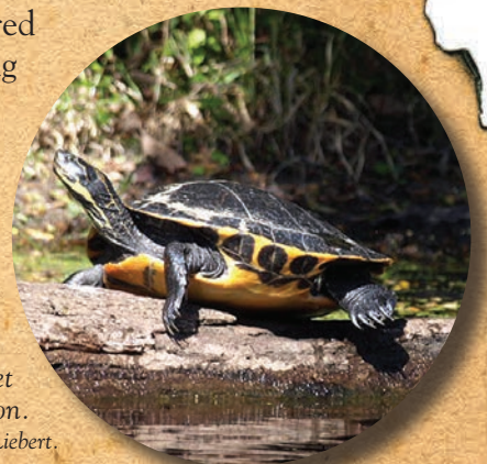
Cooter. This basking turtle may be the Suwannee cooter or a similar-looking close relative. They are difficult to distinguish without having them in hand. Their diet consists mainly of aquatic vegetation.