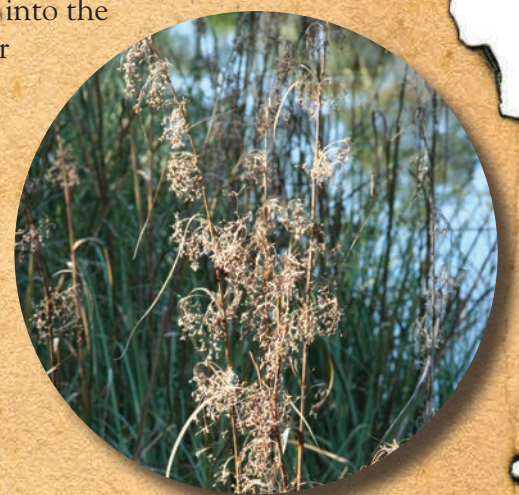
Sawgrass, a plant normally found in freshwater marshes.

Barnett Creek gradually broadens out as it approaches its confluence with McCormick Creek. Even here, however, small patches of sawgrass and a woody shrub called high tide bush occupy higher spots. Narrow ridges support occasional cabbage palms, but pines and deciduous trees drop away as you get closer to the Gulf. Ospreys, bald eagles, and wading birds may be seen overhead. You may hear the clicking call of a rail, but are unlikely to see one. Although few animals are seen, the salt marsh is teeming with life. Marsh grasses capture the abundant nutrients flowing into the estuary. The living grasses provide shelter, and the residue of dead grasses provides nourishment for many small animals. These small animals provide sustenance for larger fishes, wading birds, and predators like pelicans, ospreys, and eagles. These marshes benefit man by serving as nurseries for the immature stages of many important marine fishes and invertebrates, and by protecting the land from storm surge conditions. Animals and plants characteristic of both the uplands and the coastal marshes can coexist here when conditions are favorable. Alligators are common, as are freshwater fishes like smallmouth bass; both may venture into brackish waters to feed on abundant small fishes and invertebrates. Raccoons and river otters may forage here as well. Bald eagles and swallowtail kites may be seen overhead.