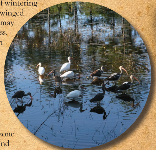
Three adult and eight juvenile white ibises feed in a shallow freshwater pond in the headwaters area of McCormick and Barnett Creeks.

A visit to this headwaters pond in the winter offers the opportunity to view several species of wintering waterfowl. So-called puddle ducks that feed primarily on vegetation, pintails and green-winged teal have been spotted here, as have species of diving ducks. Mottled ducks and wood ducks may also use the pond. The overlook provides a good opportunity to get a closeup view of sawgrass. This emergent grass-like plant is not a true grass, but rather a sedge, and is a common resident of Florida freshwater wetlands. Growing around the edges of this pond, it is tall, has triangular stems, and sharp sawtooth margins on the leaves.