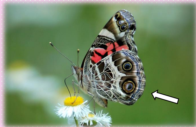
TWO big eye spots