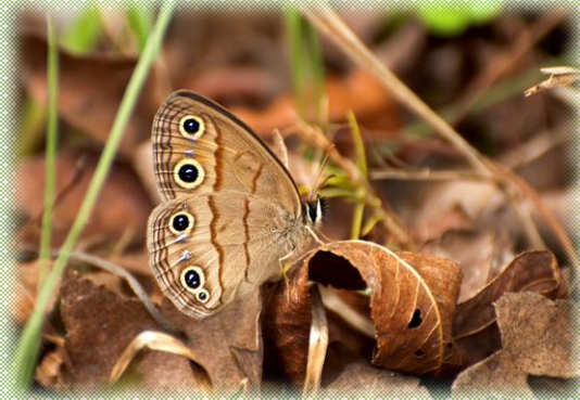
Viola's Little Wood Satyr