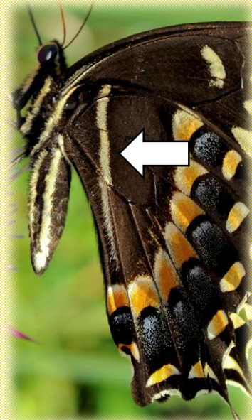
My Pal Walks The Line