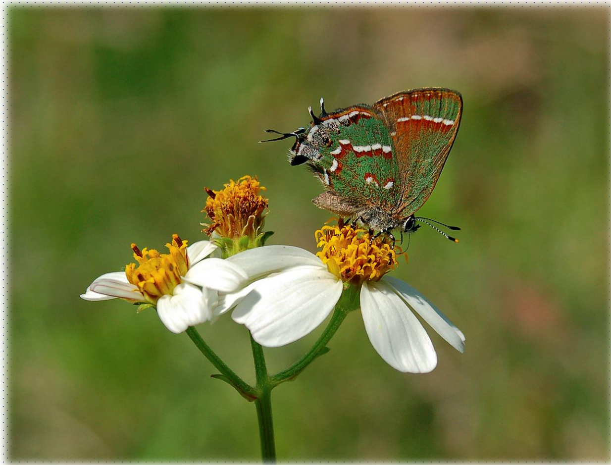
Sweadner's Juniper Hairstreak