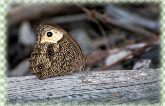
Common Wood Nymph