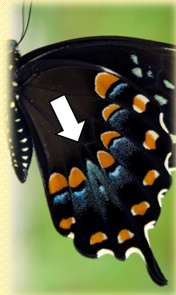
The Blue Comet