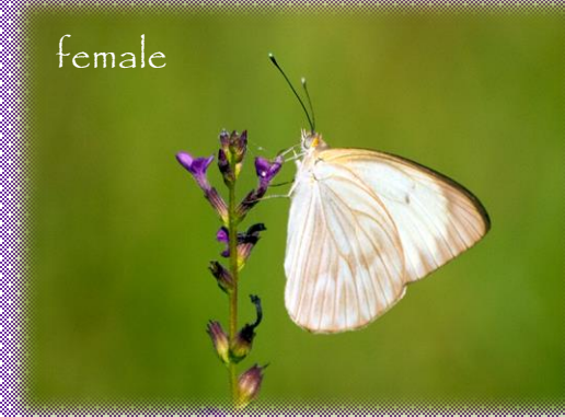
Great So. White