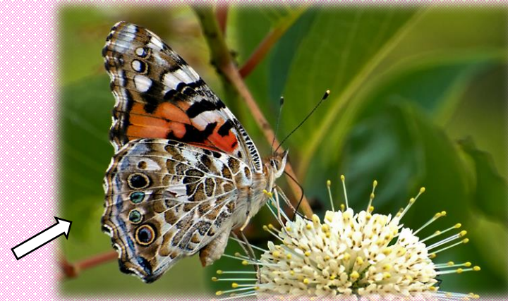
FOUR little eye spots