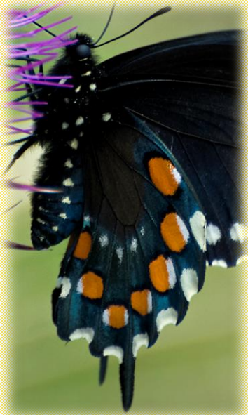
A Perfect Pipe