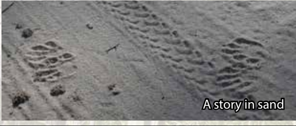
A story in sand

Several blueberry relatives are among the pines: sparkleberry, deer berry and shiny blueberry.