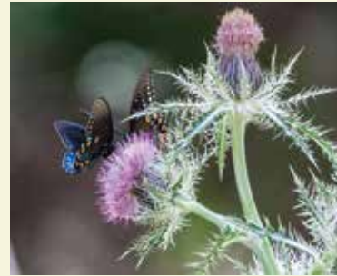
Pipevine swallowtail butterfly on a purple thistle.

Mile 8.9 (N 0.0), (29° 21' 53.84" N, 83° 02' 17.36" W)- North Entrance gate, and information kiosk.