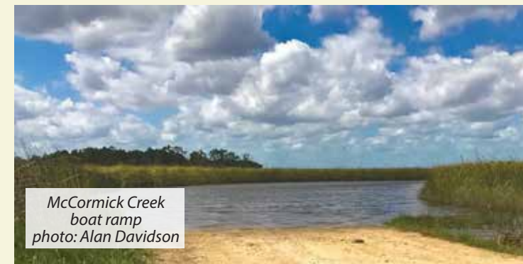
McCormick Creek boat ramp

Refuge headquarters is less than a mile north off SR 347. The River Trail with a Suwannee River view and the Tram Ridge Trail begin there. Visit the Refuge bat house to learn how the Brazilian free tail bat adapted to life in a man-made structure after large hollow trees, called snags, were removed by loggers.