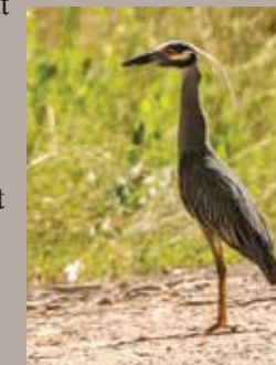
A yellow-crowned night heron photographed on Cabin Road.

The Refuge provides habitat and feeding grounds for large critters like deer, alligators and wild hogs. Coyotes, bears, bobcats, otters, foxes, and Gulf coast minks are supported by the lands flanking the Suwannee River and the Gulf, but are rarely seen by visitors. Look for wading birds such as herons, egrets, and rails in the marshes.