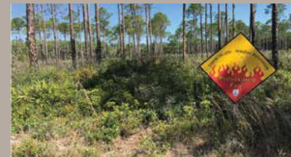
Wildlife thrives in areas where plants vary.

Gopher tortoises have adapted to living in dry habitats with frequent fires by digging burrows deep into the sandy soil. The absence of natural fire cycles in pine forests spells hardship for tortoises. The dense vegetation (shrubs, brambles, small trees)