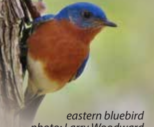
eastern bluebird

Become a FRIEND today so — the animals the Suwannee our way of life are here TOMORROW