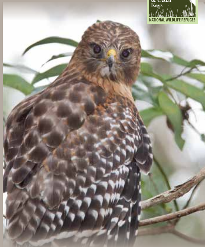
red-shouldered hawk