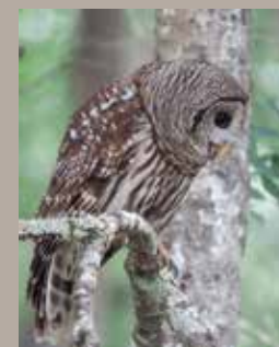
A barred owl near McCormick Creek.

The Lower Suwannee National Wildlife Refuge, unlike other Refuges, was not established for the protection of one or a few species but to protect the high water quality of the Suwannee estuary. The Suwannee River is a tannic, clear, black-water river.