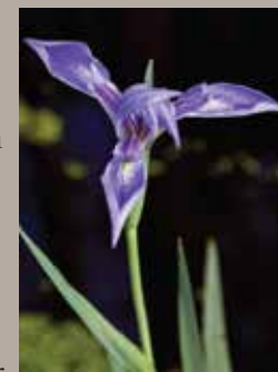
Native blue flag iris are found in marshy areas.

Gopher tortoises are found in the driest parts of the Refuge where longleaf pine and wire grass are being restored. A keystone species, the tortoises' oval-shaped burrows are co-opted by over 360 other small species.