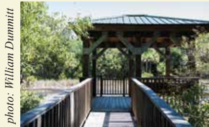
Boardwalk overlooking a headwater pond.

Mile 2.3 (N 6.6), (29° 17' 51.05" N, 83° 03' 32.31" N)- A natural freshwater pond with boardwalk and overlook where wading birds, waterfowl and alligators are frequently seen.