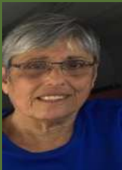
Jeri Treat Outreach

Others rolling off, but will serve as champions for programs/activities: