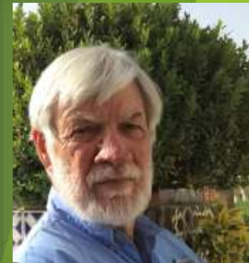
Russ Hall Science