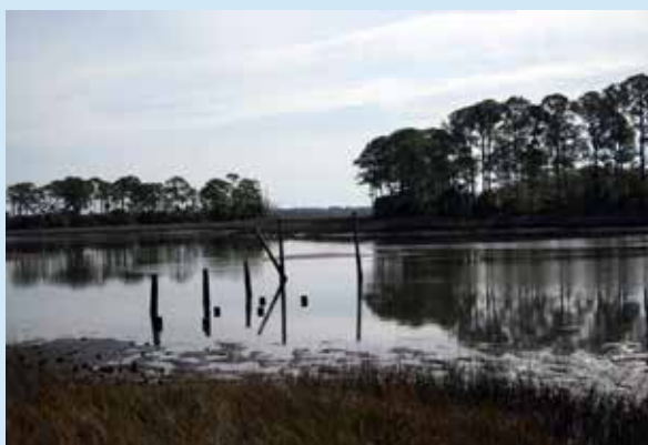
A view of Dennis Creek

This maritime hammock is not undisturbed because it has been subjected to controlled burning. Here as elsewhere in the refuge, managers attempt to recreate pre-settlement conditions in which naturally occurring fires led to suppression of hardwoods and persistence of pines, which cannot reproduce in the shade of heavy deciduous plant cover. Fire is one more force that has produced what you see here today. Most of the plants are somewhat tolerant of occasional flooding by saltwater and are also thriving here because they are tolerant of periodic fires. Perhaps the champion tree in both categories is the cabbage palm. It is almost impossible to kill this tree with fire, and it is the last tree species to die when maritime hammocks are overcome by rising seas.