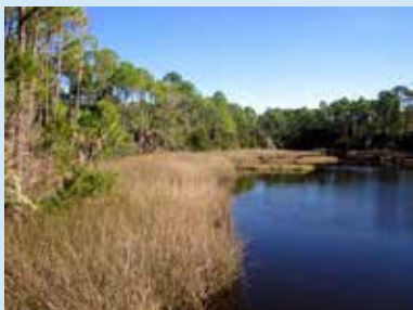
Tidal pool with fringe of cordgrass

Climb the observation platform to overlook a tidal pool and observe the transition between land and sea. In the foreground are greenish-yellow fringes of relatively short grass-like plants. This is smooth cordgrass ( Spartina alterniflora ). Tolerant of flooding, it is regularly submerged in the twice-daily tidal cycle.