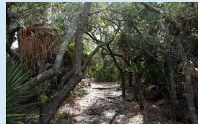
A maritime hammock

This is a maritime hammock—an area of higher ground surrounded by lower-lying marsh. Redcedar and slash pine often occur on the edges of these hammocks, while their interior areas are dominated by scrubby hardwoods. This gives them a distinctive appearance in