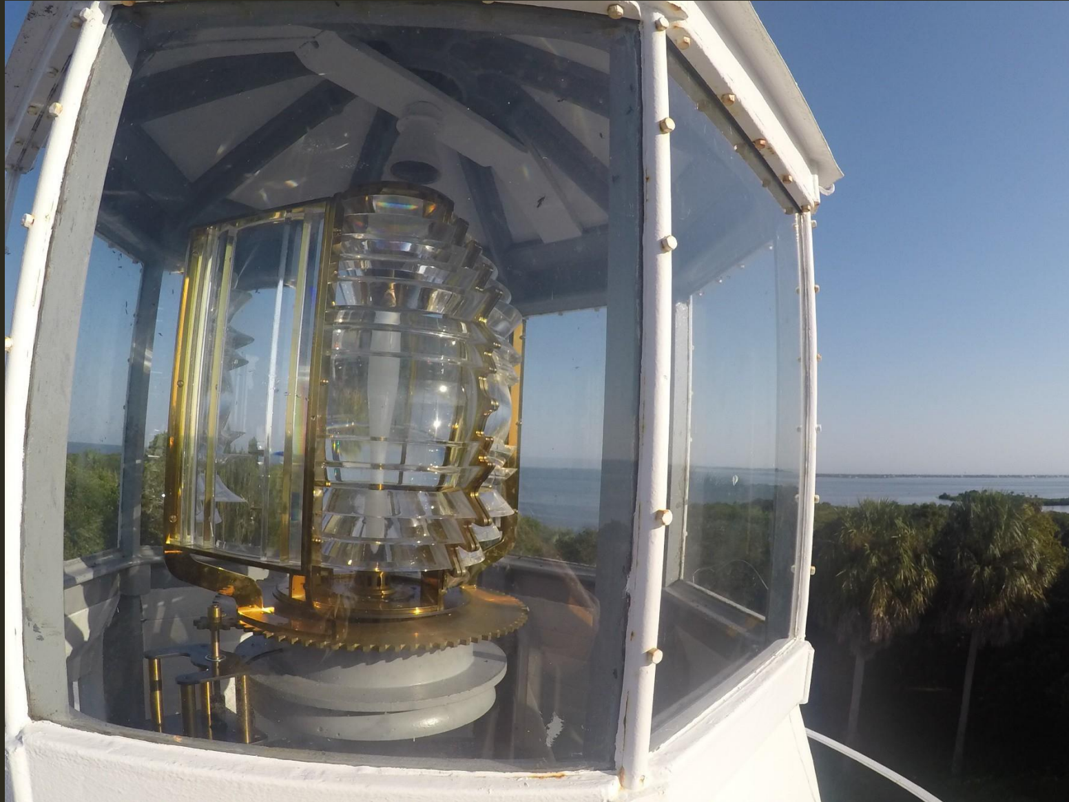
New (replica) Fresnel Lens and Mechanism