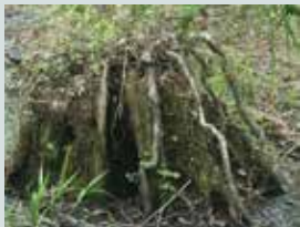
These forests were logged many times in the past. Can you see the stumps of trees like this one? Some may have been 16' in diameter.

The lower Suwannee River is tidally influenced, and the regularity and degree of the twice-daily flooding greatly affects the vegetation; bald cypress and tupelo dominate the swamp. Trees often develop unique characteristics to allow periodic submergence, including cypress knees and fluted trunks, but cannot survive continuous inundation. Rich organic debris makes its way downriver during these cycles, providing a vital source of nutrients to the estuary.